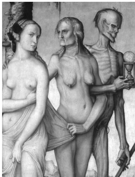
'The Ages of Man and Death', Hans Baldung-Grien © Museo Nacional del Prado

Visit www.embl.org/aboutus/onlineseminars to see what's available so far.