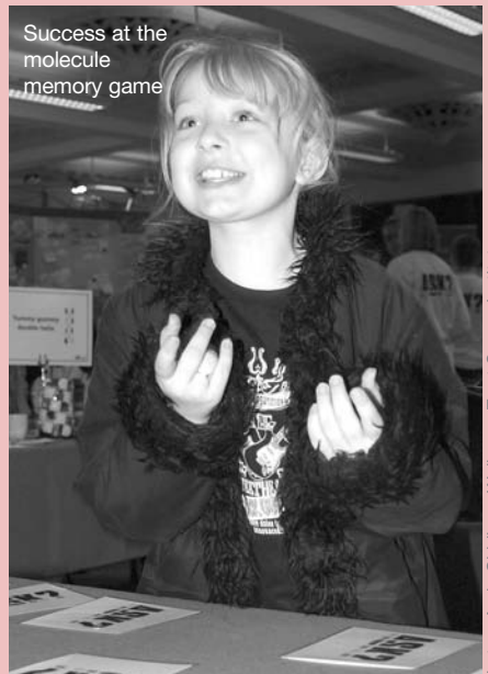
Success at the molecule memory game