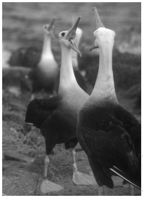
The courtship dance of the waved albatross.

If a parent is killed, the chick will not survive. Here we have a long-lived species that breeds very slowly and is incredibly vulnerable to population decline. The question now is whether the impact of the fishing industry is measurable, and for that you need data. This was our job. Over the past five years, the team had caught several thousand albatrosses on the island and tagged each with a numbered band. Every day we would go through the colony and report on every bird. We know which parents had which chicks, which chicks fledged and which did not, and which had starved to death. The team has basically been doing a daily census for the past five years, gathering survival