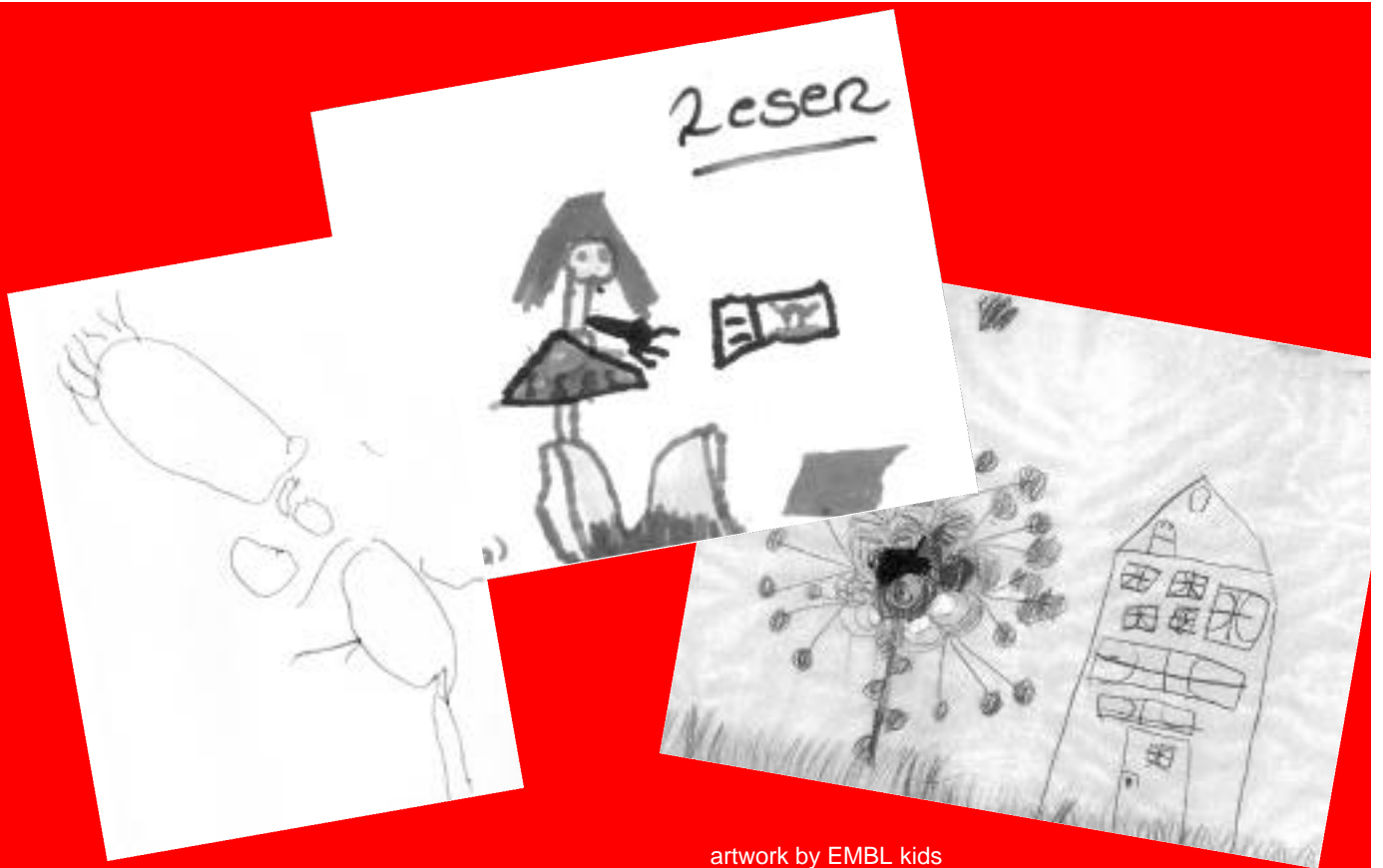
artwork by EMBL kids

understand the logic behind these mistakes would lead him to establish an entirely new school of psychology. Since the appearance of his first important books and papers in the 1940s, the mainstays of his theory have been supported by countless observations and experiments.