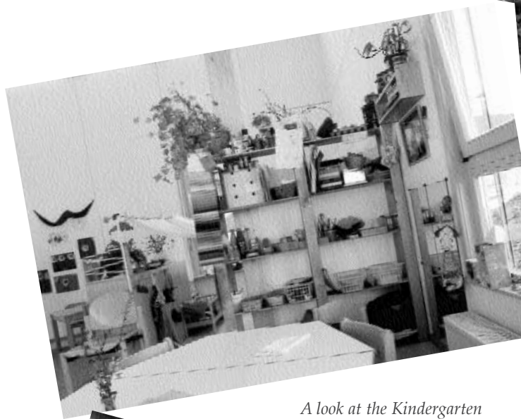
A look at the Kindergarten from inside...