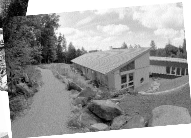
The completed buildings