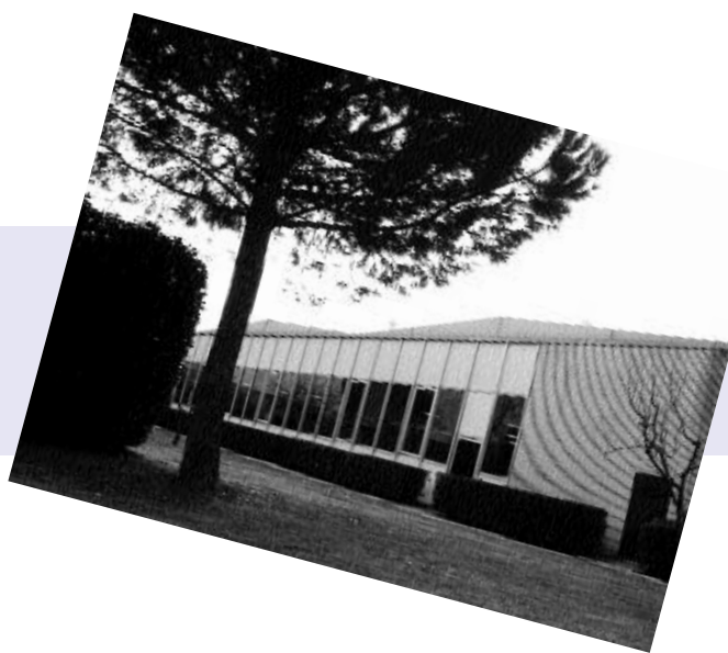
The Adriano Buzzati-Traverso campus in Monterotondo, Italy