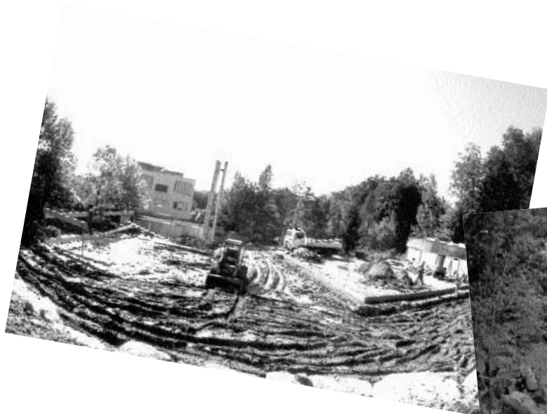
Laying the foundation for EMBL's new Kinderkrippe and Kindergarten