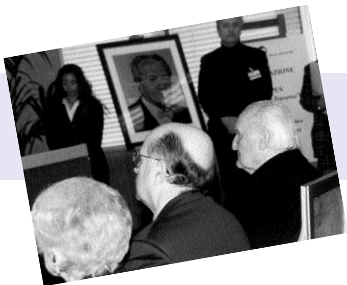
Italy's President Oscar Luigi Scalfaro (at right) attended ceremonies inaugurating the new campus

At a reception held on the grounds of a Foreign Ministry villa next to the Tiber, in the balmy Roman evening, the EMBL staff from Monterotondo, the Council delegates and the contingent of EMBL personnel from Heidelberg had the opportunity to mix with Italian dignitaries and celebrate this "debut" of the new EMBL Unit in Italy together.