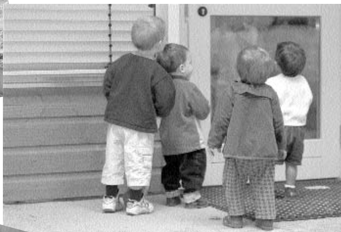
...and from outside