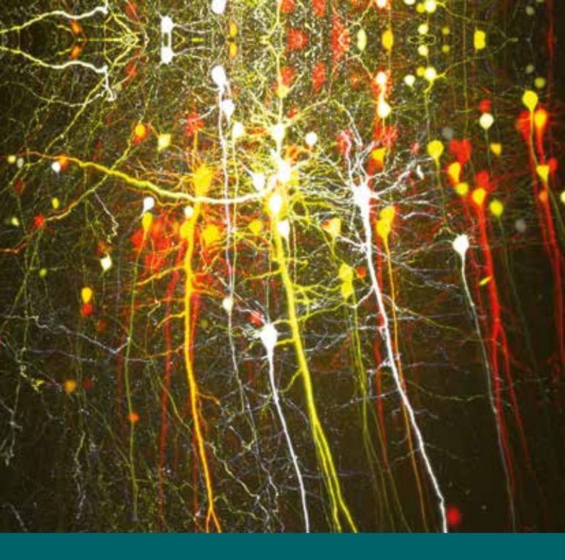
EMBL Rome in brief