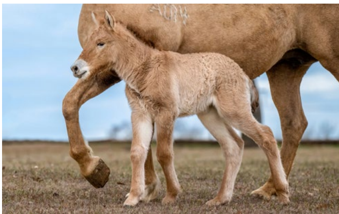
Cells preserved in the 1980s were later used to help recover a Przewalski's horse.

By preserving life at the cellular level, we are safeguarding options for future generations to understand and protect the diversity of life on Earth. Philanthropic support will empower the Cryozoo to act where it matters most: capturing irreplaceable cellular resources before they disappear, strengthening long-term storage capacity, and advancing groundbreaking research that transforms preserved cells into knowledge and solutions for the future.