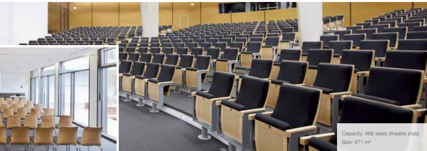
Capacity: 466 seats (theatre style) Size: 471 m 2

The impressive Klaus Tschira Auditorium is the heart of the EMBL Advanced Training Centre. It hosts state-of-the-art technical equipment to ensure your event runs effectively. The 823 m 2 foyer area provides ample space for catering (up to 500 people) and exhibitions.