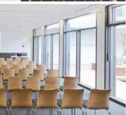
Courtyard Seminar Room Capacity: 100 seats (theatre style) Size: 113 m 2