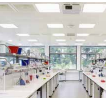
Training Labs Capacity: 24/48 (two per bench) Size: 131 m 2